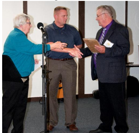
Montmorency County Police