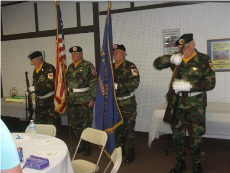
VFW Post #2356 – (Montmorency County)