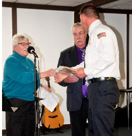
Hillman Fire Department