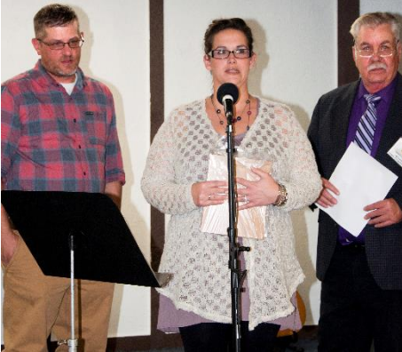
Zimmer's Corner Cafe – Business of the Year