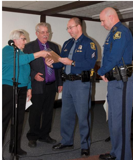
Michigan State Police