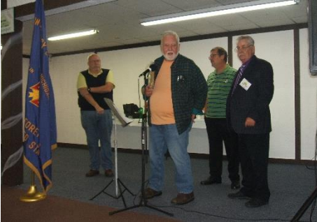
Hillman Community Radio – Business of the Year