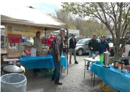
Lions Club Food Tent