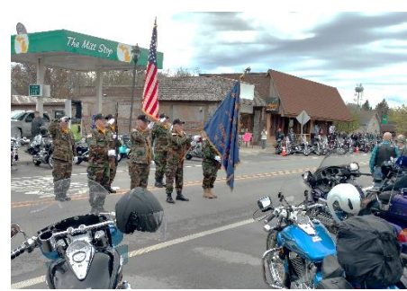
VFW Presenting Colors