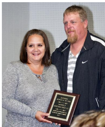
VanPamel's Hometown Diner